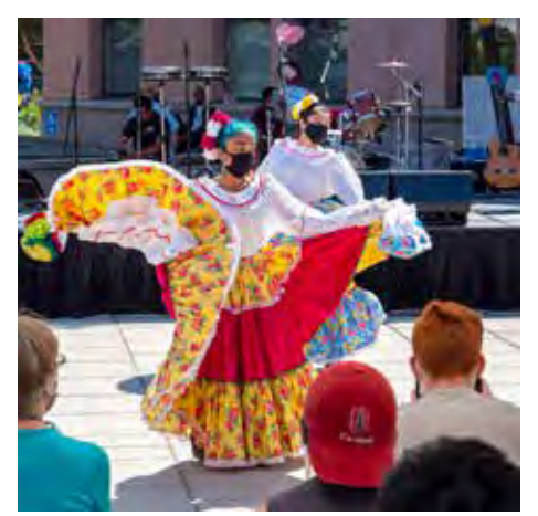
Colorful dancers from Baile Folklorico Raices de Mexico.

Here are a few more special moments from our party captured by Jack Owicki. View even more of Jack's images at Pro Bono Photo .