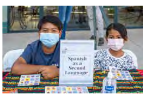
Young tablers tout our new Spanish As a Second Language program.

WISE is offered in partnership with the County Office of Labor Standards and Education (OLSE) and the Fair Workplace Collaborative (FWC), both programs of Santa Clara County.